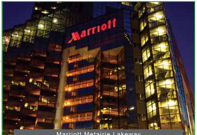
Marriott Metairie Lakeway

BONUS: Successful completion of this seminar entitles you to six (6) Professional Development Hours!