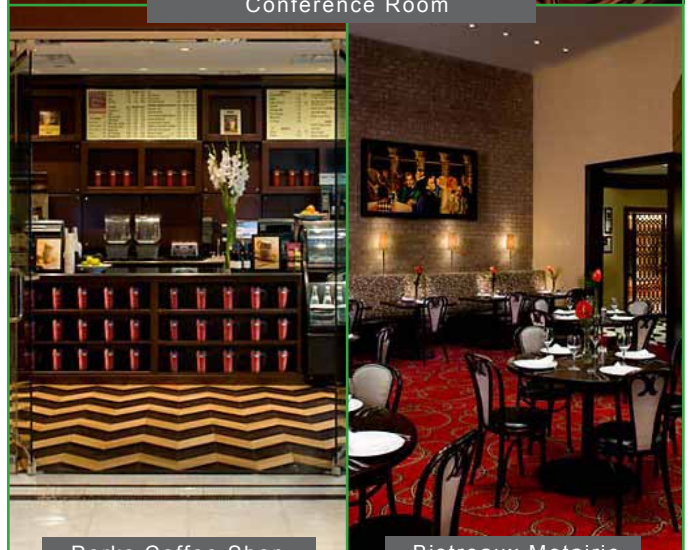
Perks Coffee Shop